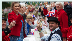
A street party in south London in June 2012 as people celebrated Queen Elizabeth II's Diamond Jubilee. This year they will celebrate Her Majesty's Platinum Jubilee.